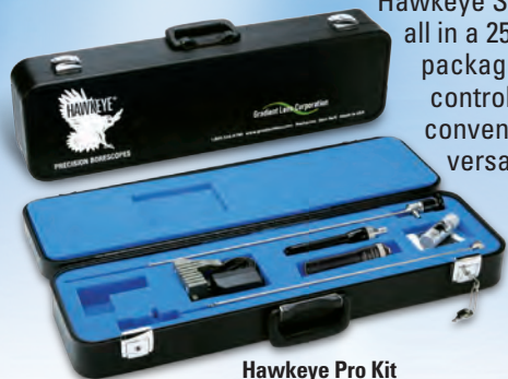
Hawkeye Pro Kit

The new Hawkeye SuperNOVA LED delivers more light, longer run time, LED longevity, and more convenient intensity control. It is 90% brighter, and runs twice as long as the old Hawkeye SuperNOVA, all in a 25% smaller package. Intensity control is now more convenient and versatile.